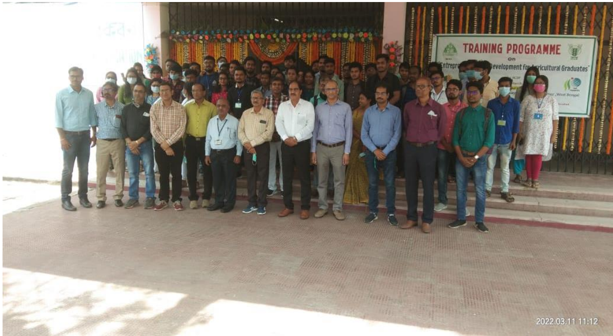
Group photo with participants and speakers